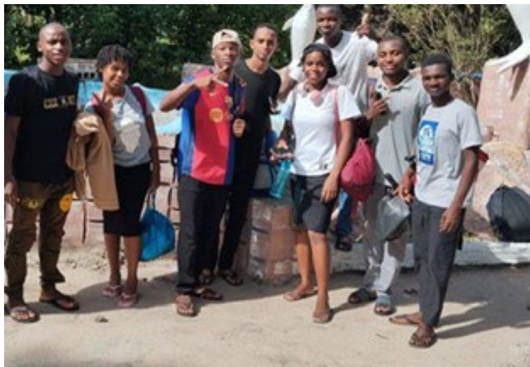
The eight new members of the Doctors for Mozambique 2025 family

They added a new family: Doctors for Mozambique!